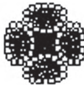
4 x 39 Galv. Fiber Core