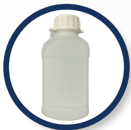
BUNKER FUEL BOTTLES