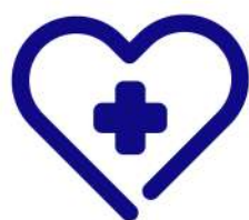
Medical & Fitness Compliance