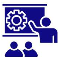
Certified Teams & Trainings