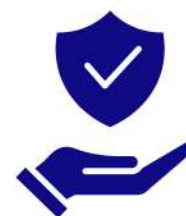
Risk & Insurance