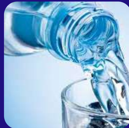
SUPPLY OF DRINKING WATER