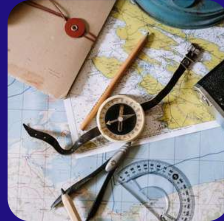
CHARTS AND PUBLICATIONS