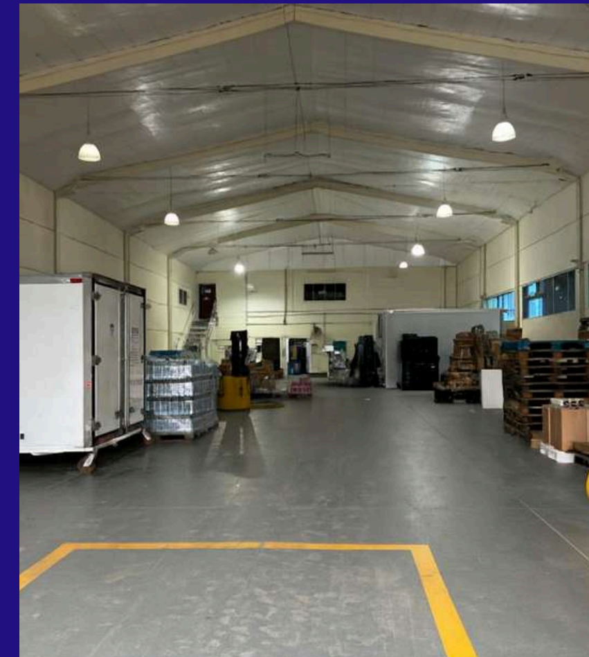
Spacious warehouse with multiple cold storage rooms, structured for fast and efficient logistics operations.