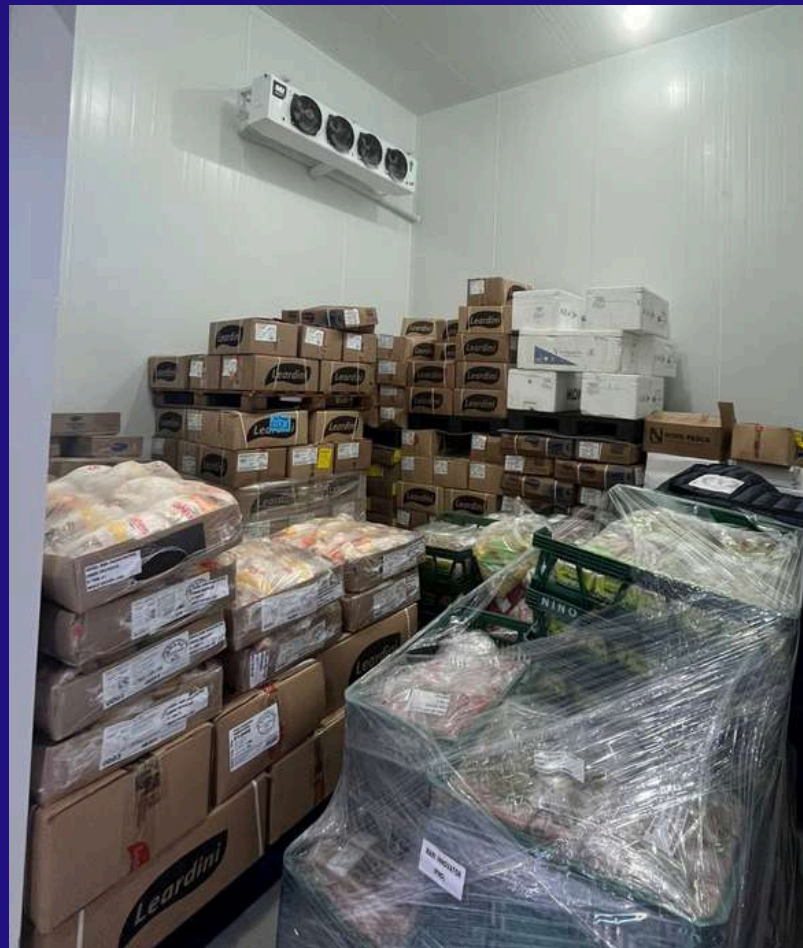
High-capacity cold storage rooms, designed for safe and organized storage

Complete structure for refrigerated and dry storage, and efficient order preparation.