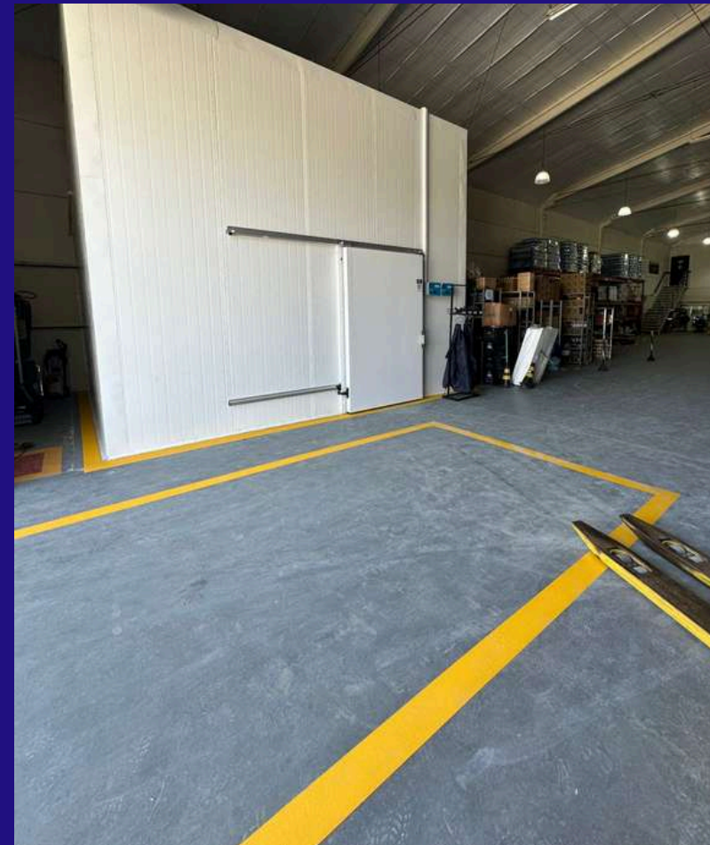
Climate-controlled storage area, ensuring product quality and control.