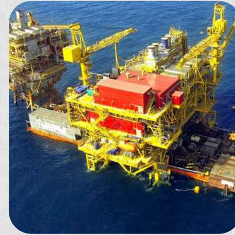
OFFSHORE SUPPORT VESSELS