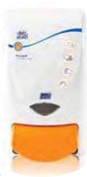
Deb-Stoko Protect Dispenser CODE : PR01LDS