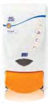
Deb-Stoko Protect Dispenser CODE : PR01LDS