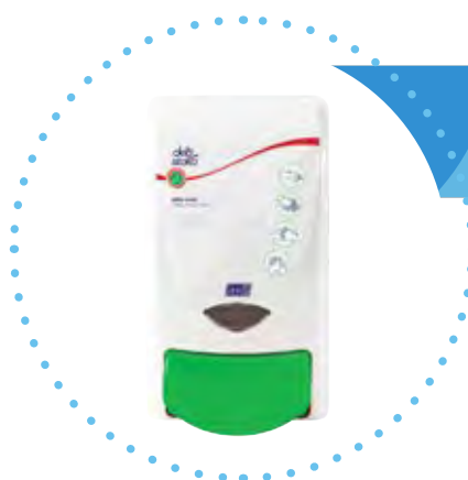
Deb Stoko Restore Dispenser Code: RES1LDS