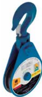
SWIVEL HOOK (SH)