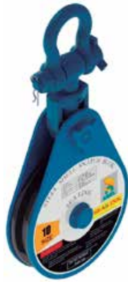
SWIVEL SHACKLE (SS)