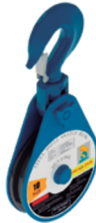
SWIVEL HOOK (SH)