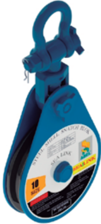
SWIVEL SHACKLE (SS)