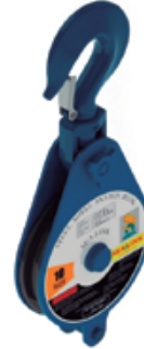
TOP DEAD END (TDE)