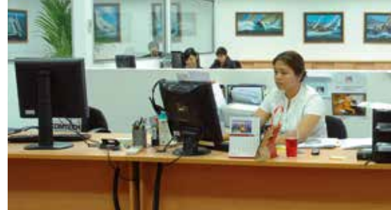
Singapore, Asia Pacific & Middle East