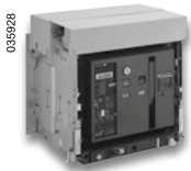
Masterpact M Circuit Breaker