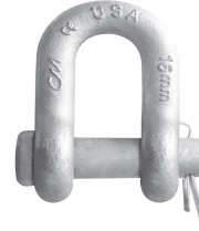
Round Pin Type