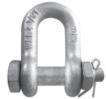
Bolt &amp; Nut Type