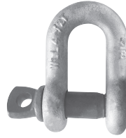
Screw Pin Type