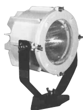
746A CLASS I DIV. 2

U.L. 1598A, 844 NEMA 4X & 7 Hazardous Location Class I Division 2 Groups A, B, C & D