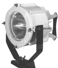
746AQHDL CLASS I DIV. 2