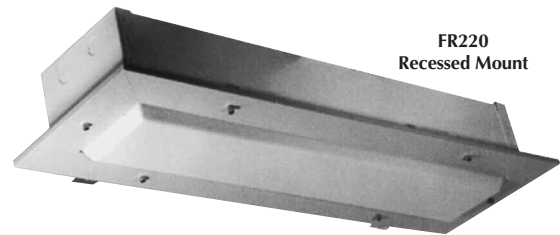
FR220 Recessed Mount

U.L. 1598A Marine, U.L. 1571 Fluorescent U.S.C.G. Accepted—20 Watt – 40 Watt