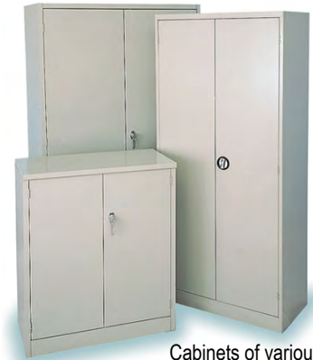
Cabinets of various sizes