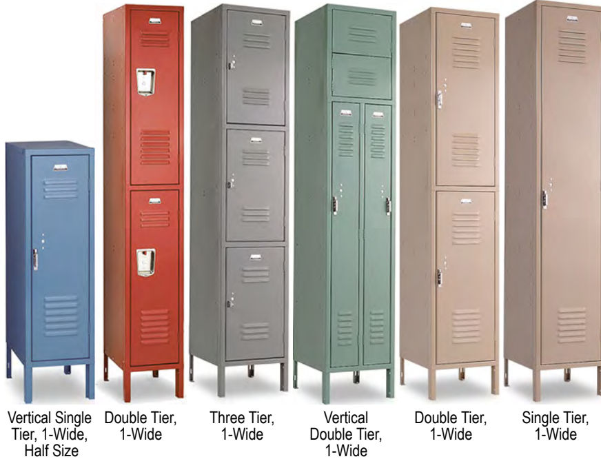
Vertical Single Tier, 1-Wide, Half Size Double Tier, 1-Wide Three Tier, 1-Wide Vertical Double Tier, 1-Wide Double Tier, 1-Wide Single Tier, 1-Wide

Capital Bedding offers metal lockers, cabinets, benches, and custom metal enclosures in many sizes, colors and options: Single, Double or Triple Tier, assembled or unassembled, whatever the need. Our brands include: Penco, Republic, & Lyon's Metal products. We also have our own metal facility to construct custom lockers.