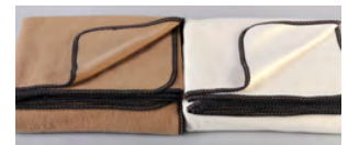
100% Polyester Polar Fleece Blankets