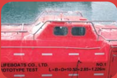
Totally Enclosed Lifeboat