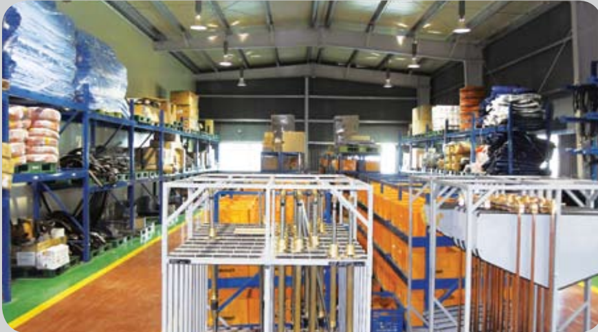
Ready to deliver all Lifeboats and Davits Spare Parts

HyundaiLifeboats provides original spare parts, will provide the correct and suitable spare part quickly. All parts of lifeboats and davits registered under HyundaiLifeboats in accordance with design specifications also for other maker's spare