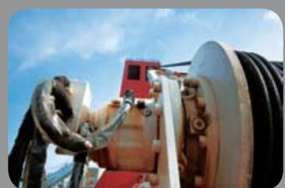
Free fall Lifeboat Davit