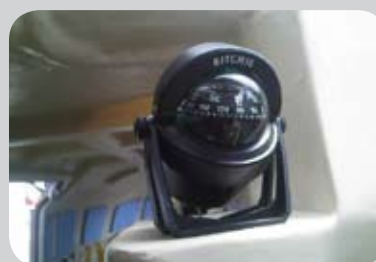
Lifeboats Repairs and replacement