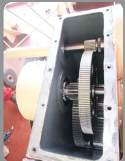
Hinged Gravity Davit and Winch