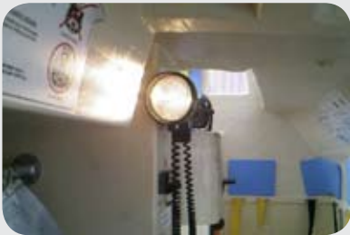
Safety Check electric system between Lifeboats and onboard