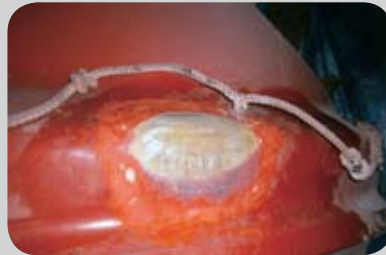
Lifeboats FRP repair and surfaced