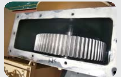
Gasket Replacement for Davit