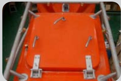
Lifeboats Repairs and replacement