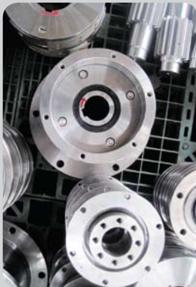
Davit Winch Brakes System