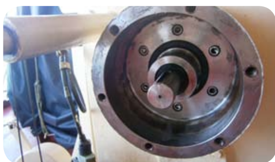
Rescue boat Davit and winch