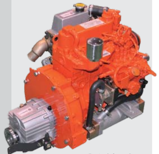
Engine's Spare Parts